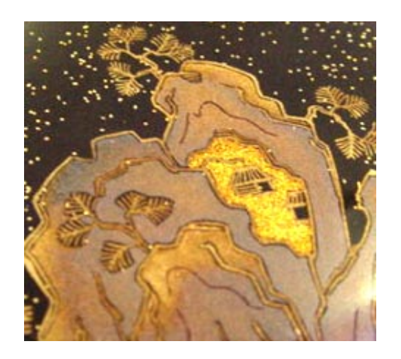
Togidashi Makie (polished makie)