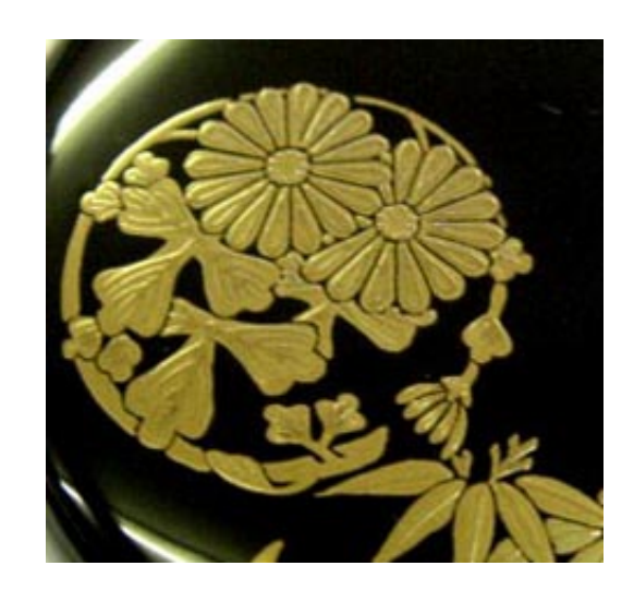
Hira Makie (flat makie)

a technique for which a painted design is applied at the time of the middle lacquer, on top of which urushi is layered. Then the entire surface is polished so that the painted design floats into view. Said to be the origin of makie.